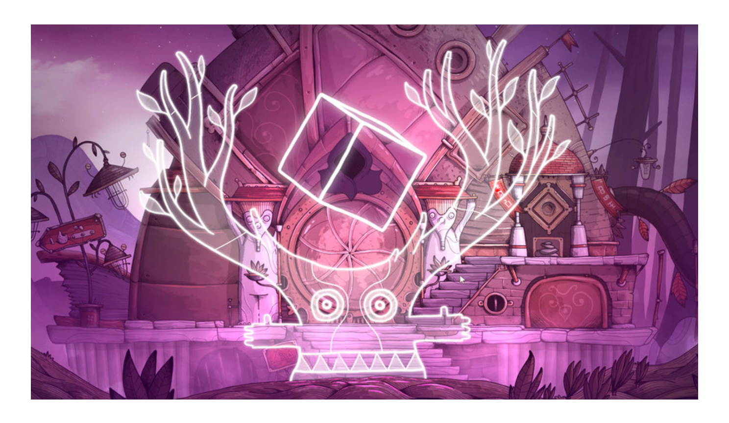
Uncanny Valley - Soundtrack Activation Code [serial Number]

Download ->>->> <a href="http://bit.ly/2JjGcFM">http://bit.ly/2JjGcFM</a>